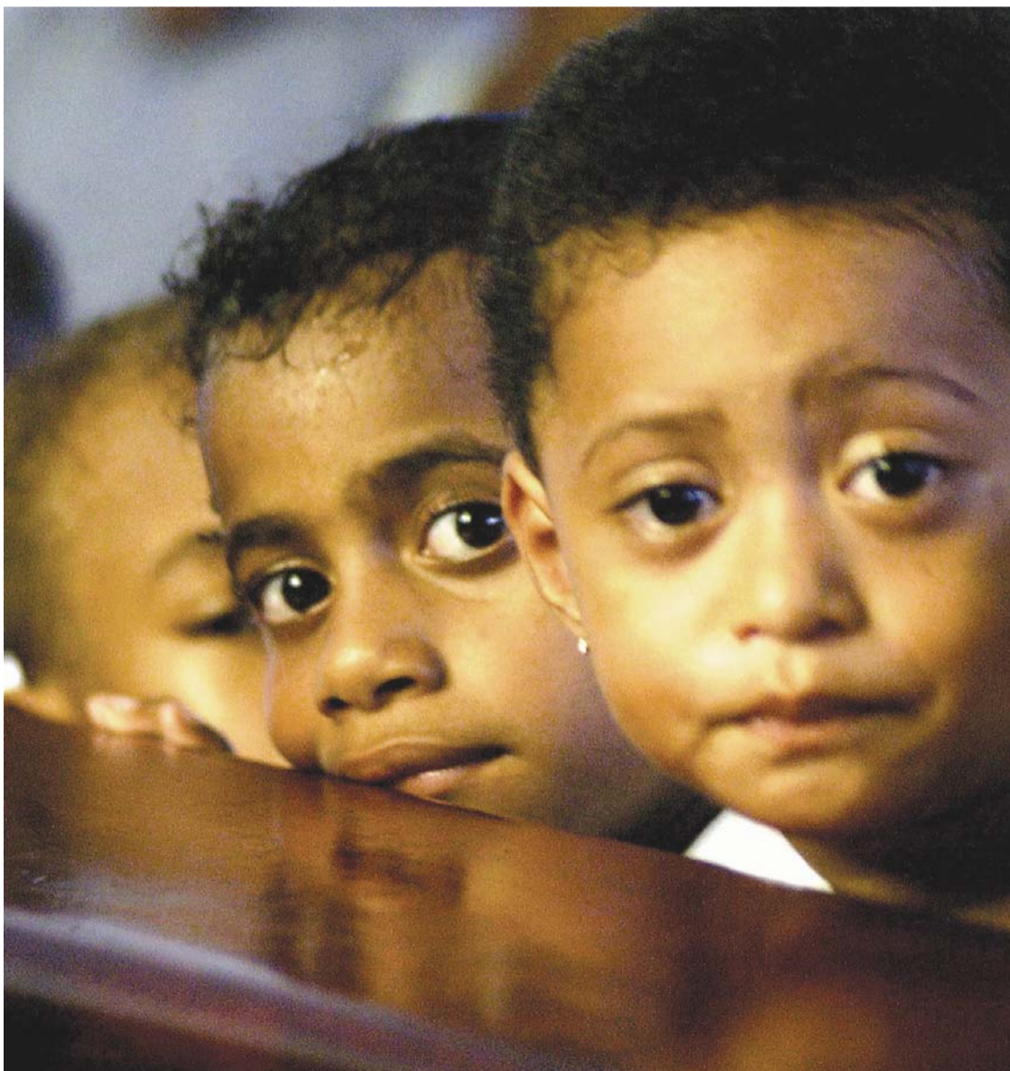
Blessed are the children... first-timers to school this year at the church service yesterday.